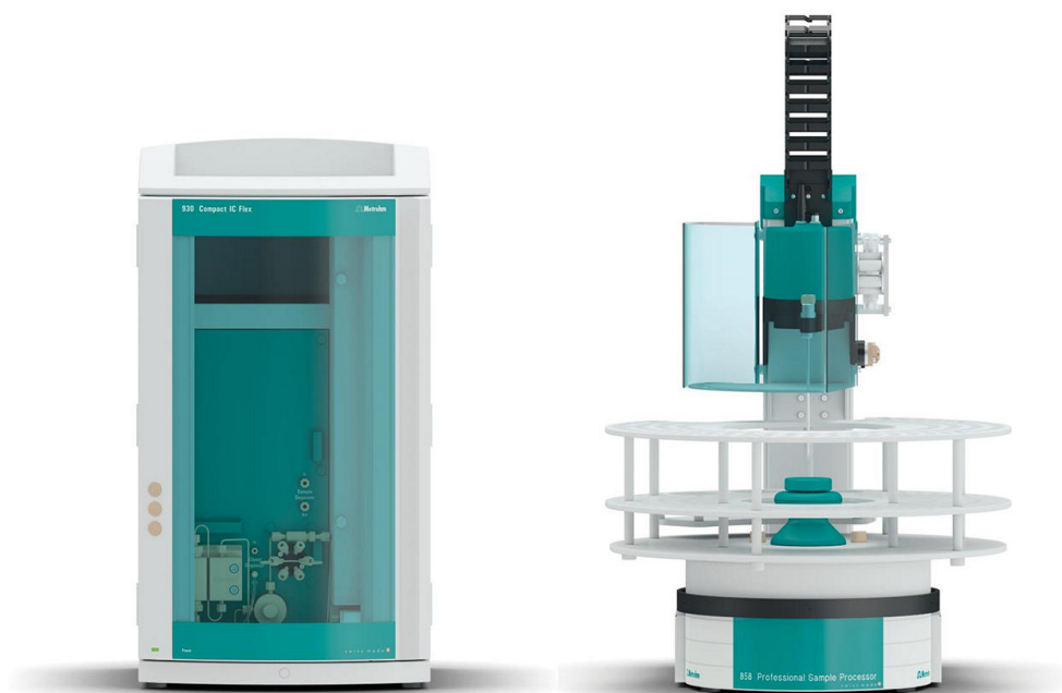
Figure 1. Instrumental setup including a 930 Compact IC Flex Oven and an 858 Professional Sample Processor.

Samples and standard solutions are injected directly into the ion chromatograph ( Figure 1 ) using an 858 Professional Sample Processor. Potassium is separated from all other cations using a Metrosep C 6 -150/4.0 column.