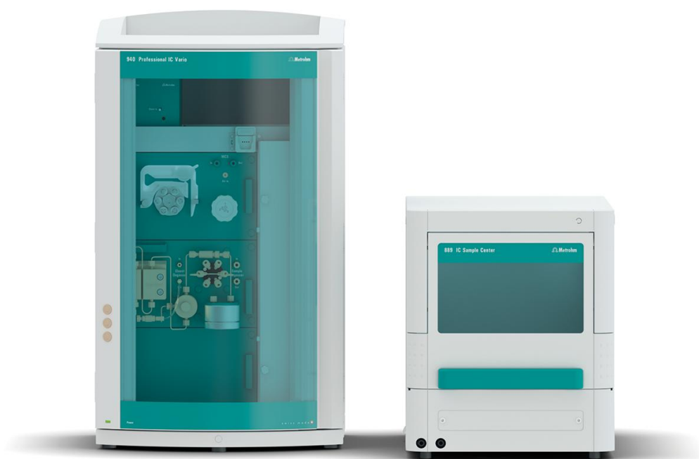
Figure 1. Instrumental setup including a 940 Professional IC Vario ONE/SeS/PP, IC Conductivity Detector (L) and the 889 IC Sample Center (R).

analyzed with a 940 Professional IC Vario using the method parameters given in the respective USP monograph (Table 1).