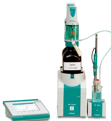
Figure 1. 905 Titrando equipped with a Solvotrode easyClean for the analysis of the epoxide equivalents controlled by a 900 Touch Control.

The sample is weighed into a titration beaker, and then dissolved in either chloroform or methylene chloride. Afterwards, TEABr reaction solution and glacial acetic acid are added, and the sample is titrated with standardized perchloric acid until after the equivalence point is reached.