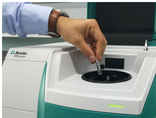
Figure 1. DS2500 Liquid Analyzer and a diesel exhaust fluid sample filled in a disposable vial.

Aqueous urea samples with different urea content from 0.5% to 40% (v/v) were measured in transmission mode with a DS2500 Liquid Analyzer over the full wavelength range (400–2500 nm). Reproducible spectrum acquisition was achieved using the built-in temperature control at 40 °C. For convenience, disposable vials with a path length of 2 mm were used, which made cleaning of the sample vessels unnecessary. The Metrohm software package Vision Air Complete was used for all data acquisition and prediction model development.