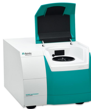
Figure 1. DS2500 Liquid Analyzer.

23 marine cylinder lubricants and 37 engine lubricants were analyzed on a Metrohm DS2500 Liquid Analyzer equipped with 2.5 mm flow cell. All measurements were performed in transmission mode from 400 nm to 2500 nm. In this feasibility study, a flow cell was used to automate the sample handling and measurement. Data acquisition and prediction model development was performed with the software package Vision Air complete.