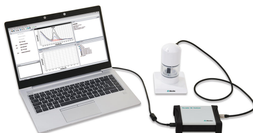
Figure 1. 946 Portable VA Analyzer (scTRACE Gold version)

The scTRACE Gold is electrochemically activated and an ex situ mercury film is deposited prior to the first determination. In the next step, the water sample and the supporting electrolyte are pipetted into the measuring vessel. The determination is carried out with the 884 Professional VA or with the 946 Portable VA Analyzer using the parameters specified in Table 1. The concentration is determined by two additions of a standard addition solution.