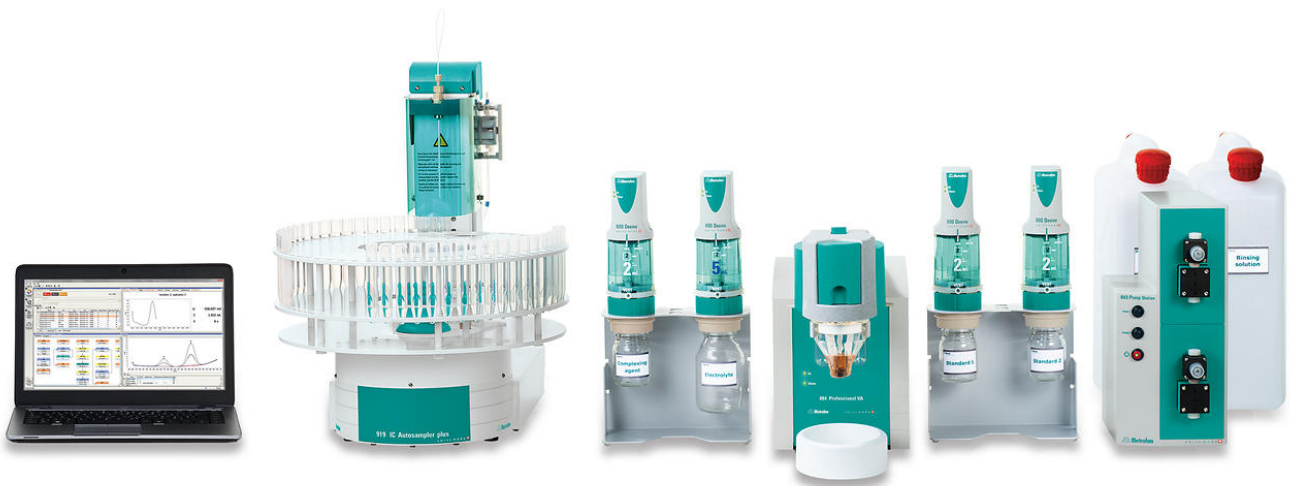
Figure 2. 884 Professional VA fully automated for VA