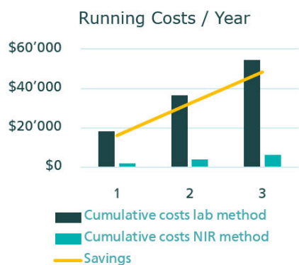
Figure 4. Comparison of the cumulative costs over three years for the determination of the hydroxyl number with titration and NIR spectroscopy.