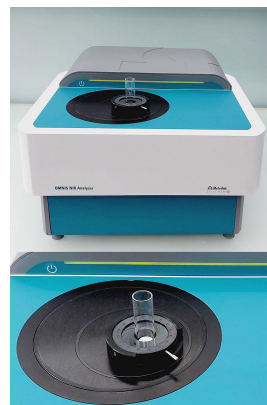
Figure 1. OMNIS NIR Analyzer Solid with 15 mm vial and Flexible holder OMNIS NIR.

The reference values were measured according to USP<922> Water Activity [3].