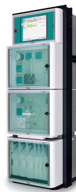
Figure 3. The 2060 TI Process Analyzer from Metrohm Process Analytics can monitor several critical parameters online in the anodizing process.

Online monitoring of the alkaline and acidic components as well as aluminum by titration is possible with the 2060 TI Process Analyzer ( Figure 3 ) or the 2026 HD Titrolyzer ( Figure 4 ) from Metrohm Process Analytics. The selection of the optimal process analyzer depends on the specific monitoring requirements (multiparameter or single parameter, respectively).