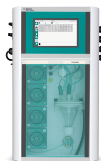
Figure 4. The 2026 HD Titrolyzer from Metrohm Process Analytics can monitor up to two critical parameters online in the anodizing process.

Aluminum is also an ideal material for other surface treatment applications. It can be cleaned using acid pickling processes to ensure complete passivation. A pickling process is also used to prepare the aluminum for applying a conversion coating as a protective surface layer.