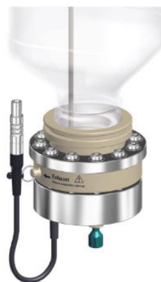
Figure 2. The 948 Continuous IC Module, CEP automatically produces KOH eluent from ultrapure water and a KOH concentrate. The electrochemical eluent production takes place at a membrane in the eluent producer cartridge.

The 948 Continuous IC Module, CEP precisely produces a potassium hydroxide eluent in concentrations from 15–100 mmol/L potassium hydroxide (KOH) ( Figure 2 ). The IC was operated with the software MagIC Net, and the MS by MassHunter software. Synchronization of both instruments was controlled via a remote cable. Table 1 lists the most important instrument settings.