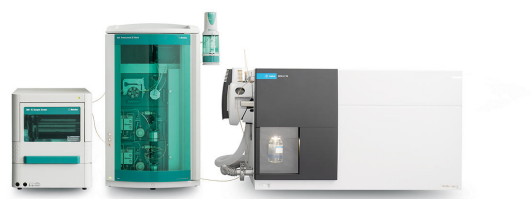
Figure 1. Instrumental setup to measure haloacetic acids, dalapon, and bromate including an 889 IC Sample Center – cool (Metrohm), 940 Professional IC Vario (Metrohm), and 6475 Triple Quadrupole LC/MS with Jet Stream Technology Ion Source (Agilent). A Dosino was used for direct infusion to the MS during method optimization.

The hyphenation of HPLC with mass spectrometry has commonly focused on the study of organic molecules. Hyphenating ion chromatography (IC) with mass spectrometry (MS) opens up the field to highly sensitive analysis of ionic and more polar substances in aqueous solutions or salt-containing matrices. Using the 889 IC Sample Center – cool guarantees stable and reproducible sample processing at 4 °C (Figure 1) by preventing the decay of the degradation-sensitive HAAs.