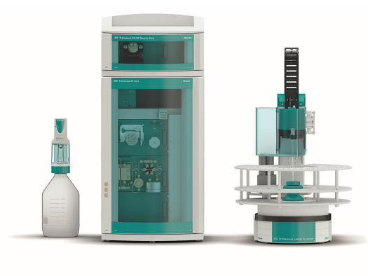
Figure 1. Instrumental setup including a 940 Professional IC Vario (center), 947 Professional UV/VIS Detector Vario SW (top center), 858 Professional Sample Processor (right), and MiPCT-ME, performed with the Metrosep A PCC 2 HC/4.0 and a Dosino (left).

After injection, the anionic components were isocratically separated within 45 minutes on a Metrosep A Supp 10 - 250/4.0 column. The UV/VIS detector signal was recorded at 215 nm. Confirmation of the method accuracy was done with a spiking study. The sample was spiked with a nitrite standard at two concentration levels (1.0 µg/L and 4 µg/L), and the recovery values were evaluated.