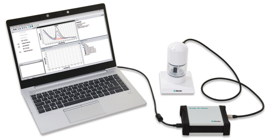
Figure 1. 946 Portable VA Analyzer

The scTRACE Gold is electrochemically activated prior to the first determination.