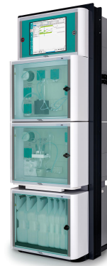
Figure 2. 2060 Process Analyzer for photometric measurements of ultratrace iron and copper in the water-steam circuit of power plants.

The metal transportation in power plant water circuits is currently monitored by CPS racks which collect particulate metals on filter pads over a period of one day to a week. The pads are later digested, and the metals analyzed by ICP-OES or ICP-MS. Total analysis time can take from one to three weeks. Monitoring only the accumulated corrosion products causes a loss of transportation peaks, and detailed information on why the metal loss occurred is lost. A maximum of 2 µg/L Fe is recommended by the Electric Power Research Institute (EPRI) in order to avoid FAC-related issues in the water-steam circuit, and these levels are not accurately measured with the current CPS racks, as seen in long-term comparisons. The continuous online ultratrace analysis of Fe and Cu in the water-steam circuit of power plants is possible using the 2060 Process Analyzer (Figure 2) from Metrohm Process Analytics. This automated process analysis system enables early detection of corrosion processes and peaks, and also monitors the formation and destruction of the protective oxide layer (Figure 3). Continuous analyses also signal a problem before dissolved metals can reach the condensate stream and thus the turbine blades where they would cause damage. In combination with the power plant's Distributed Control System (DCS), online monitoring of Fe and Cu ensures that corrosion can be controlled before it affects the power plant efficiency, ultimately decreasing downtime and lowering maintenance costs.