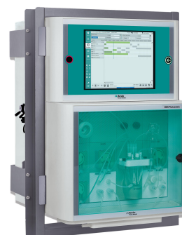
Figure 3. 2035 Process Analyzer.

Additionally, inline pH sensors can be connected to the 2060 Process Analyzer to guarantee a fully integrated system, leading to better process control.