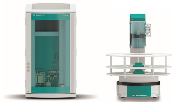
Figure 1. Instrumental setup including a 930 Compact IC Flex Oven/Deg and a 919 IC Autosampler plus.

A one-point calibration with the standard solution of 0.08 mg/mL of USP Calcium Acetate was used for quantification. Samples were evaluated as triplicates. Repeatability studies are done with 6-fold injections.