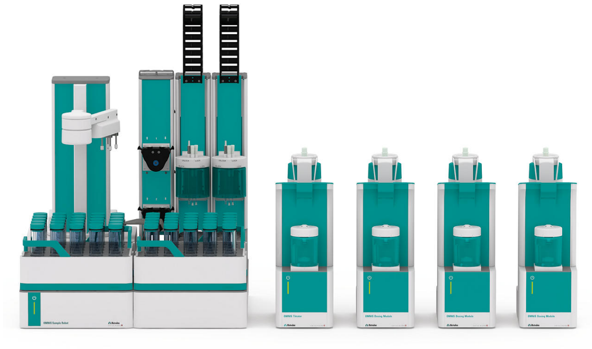
Figure 1. OMNIS Robot S with Discover and parallel analysis.

OMNIS automates the entire analysis process with: