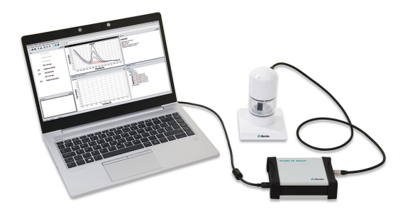
Figure 1. 946 Portable VA Analyzer (scTRACE Gold version)

The scTRACE Gold is electrochemically activated prior to the first determination. In the next step, the water sample and the supporting electrolyte are pipetted into the measuring vessel. The determination is carried out with the 884 Professional VA or with the 946 Portable VA Analyzer using the parameters specified in Table 1 . The concentration is determined by two additions of a standard addition solution.