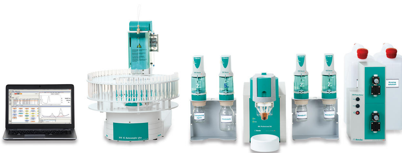
Figure 2. 884 Professional VA fully automated for VA