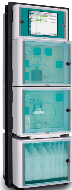
Figure 2. 2060 TI Process Analyzer for the online analysis of critical quality parameters in pickling baths using the method of titration.

over a wide concentration range—the 2060 TI Process Analyzer (Figure 2).