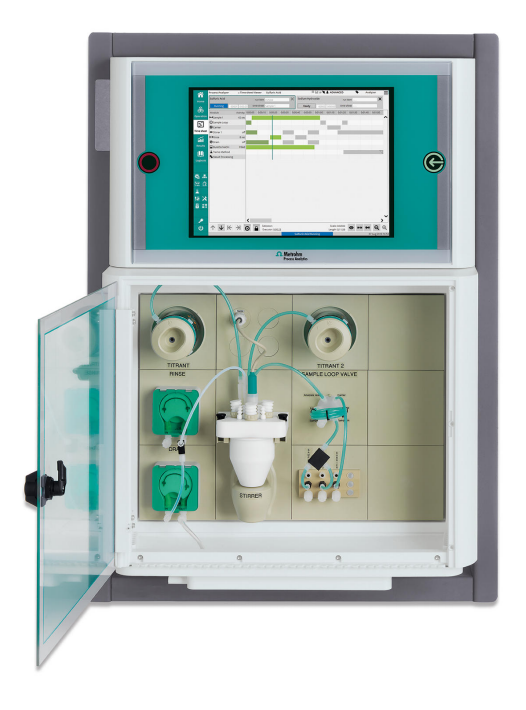
Figure 4. 2035 Potentiometric Analyzer - Thermometric.