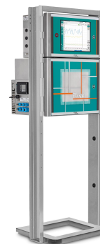
Figure 3. The 2060 The NIR-Ex Analyzer from Metrohm Process Analytics.

Each Metrohm Process Analytics 2060 The NIR-Ex Analyzer is configured for applications in ATEX zones. These instruments are capable of monitoring up to five process points per NIR cabinet with the multiplexer option.