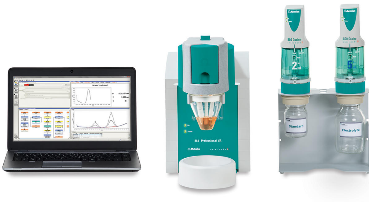
Figure 2. 884 Professional VA, semiautomated for VA analysis