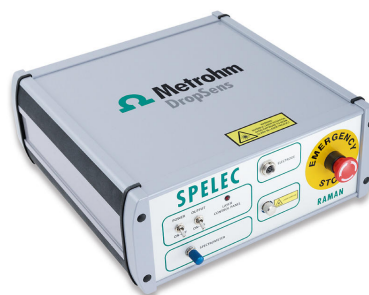
Figure 2. The SPELEC-RAMAN used for the measurements in the application note.

Screen-printed electrodes (refs. DRP-110, DRP-110SWCNT, DRP-110CNT, DRP-110OMC, DRP-110GPH, DRP-110CNF) were placed in a specific cell for this type of devices (DRP-RAMANCELL) coupled with the DRP-RAMANPROBE, which allows to perform the Raman measurements of the electrode surface at optimal focal distance. Integration time was 20 s.