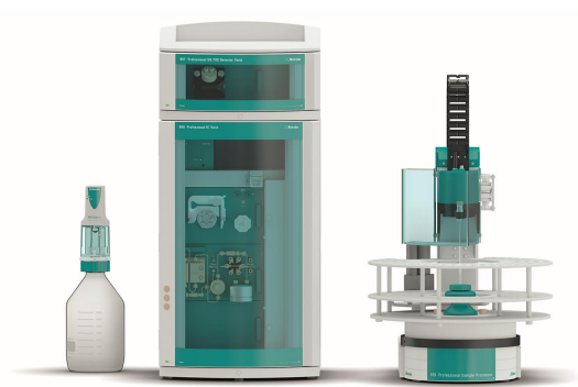
Figure 1. Instrumental setup including a 940 Professional IC Vario (center), 947 Professional UV/VIS Detector Vario SW (top center), 858 Professional Sample Processor (right), and MiPCT-ME, performed with the Metrosep A PCC 2 HC/4.0 and a Dosino (left).

After injection, the anionic components were isocratically separated within 45 minutes on a Metrosep A Supp 10 - 250/4.0 column. The UV/VIS detector signal was recorded at 215 nm. Confirmation of the method accuracy was done with a spiking study. The sample was spiked with a nitrite standard at two concentration levels (1.0 µg/L and 4 µg/L), and the recovery values were evaluated.