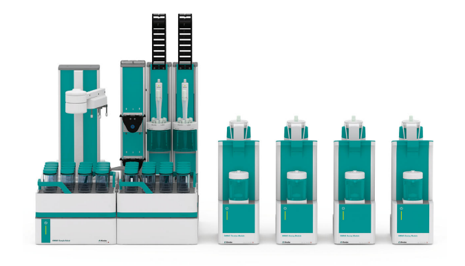
Figure 1. The OMNIS Sample Robot S equipped with an OMNIS Professional Titrator, plus a corresponding amount of OMNIS Dosing Modules to add all necessary solutions, and dPt Titrode for the automated determination of iodine value.