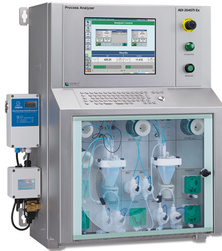
Figure 2. The 2045TI Ex proof Process Analyzer is certified for Zone 1 and Zone 2 areas.

further on in the distillation unit. The analyzer fulfills EU Directives 94/9/EC (ATEX95) and is certified for Zone 1 and Zone 2 areas.