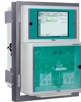
Figure 3. 2035 Process Analyzer.

Additionally, inline pH sensors can be connected to the 2060 Process Analyzer to guarantee a fully integrated system, leading to better process control.