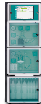
Figure 2. 2060 Process Analyzer.

In order to extract the proper compounds, keep the pH within specifications, and brew the same flavors over multiple batches, both alkalinity and hardness of the process and make-up water must be monitored and kept at proper levels. The Metrohm Process Analytics 2060 and 2035 Process Analyzers ( Figures 2 and 3 ) are ideally suited for the fully automatic execution of these important analyses, as well as additional parameters like pH or conductivity. The process analyzer can send an alarm to the plant control system if alkalinity or hardness levels are not optimal, signaling the distribution control to correct the water chemistry, ensuring consistent product quality.