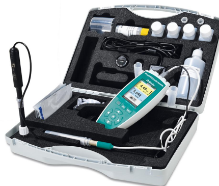
Figure 1. Transport case including all accessories and a 914 pH/DO/Conductometer equipped with an O 2 -Lumitrode and conductivity sensor for the determination of dissolved oxygen in a freshwater stream.

The sensors are both directly inserted into the surface water at the point of interest, to a depth of at least 3.5 cm.