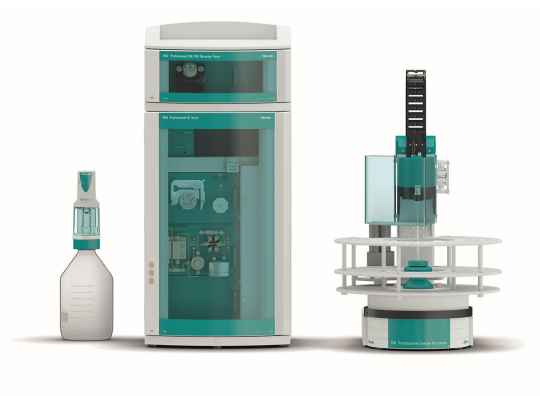
Figure 1. Instrumental setup including a 940 Professional IC Vario (center), 947 Professional UV/VIS Detector Vario SW (top center), 858 Professional Sample Processor (right), and MiPCT-ME, performed with the Metrosep A PCC 2 HC/4.0 and a Dosino (left).

After injection, the anionic components were isocratically separated within 45 minutes on a Metrosep A Supp 10 - 250/4.0 column. The UV/VIS detector signal was recorded at 215 nm. Confirmation of the method accuracy was done with a spiking study. The sample was spiked with a nitrite standard at two concentration levels (1.0 µg/L and 4 µg/L), and the recovery values were evaluated.