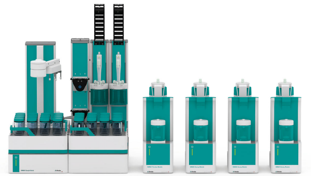
Figure 1. The OMNIS Sample Robot S equipped with an OMNIS Professional Titrator, plus a corresponding amount of OMNIS Dosing Modules to add all necessary solutions, and dPt Titrode for the automated determination of iodine value.

curve of olive oil is shown in Figure 2.