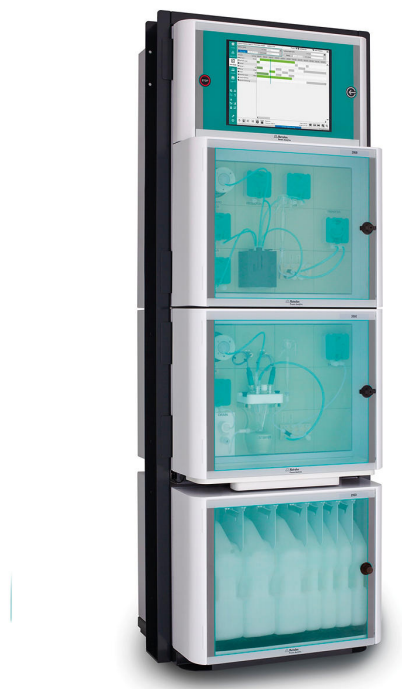
Figure 2. 2060 TI Process Analyzer used for online monitoring of hydrogen peroxide in salmon delousing baths.