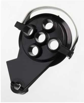
Titration vessel lid with 5 openings