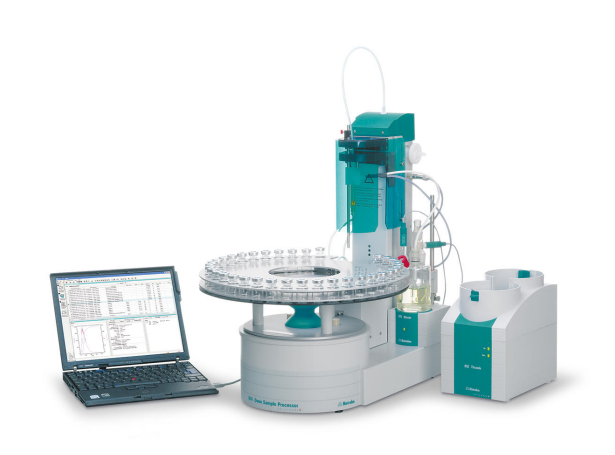
Figure 1. Fully automated system consisting of an 874 Oven Sample Processor with 851 Titrando for the coulometric Karl Fischer after vaporization of any moisture present in the sample.

Once the system is prepared and stable, the sample is placed in the oven. A carrier gas passes through the sample, transferring the vaporized water into the titration cell where the water content is determined. The titration and the gas extraction of the sample is stopped as soon as the defined endpoint is reached and the drift (amount of water per time period) falls below a predefined value.