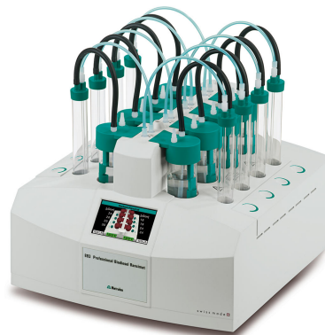
Figure 1. 893 Professional Biodiesel Rancimat equipped with measuring and reaction vessels for the determination of oxidation stability of biodiesel and its blends.