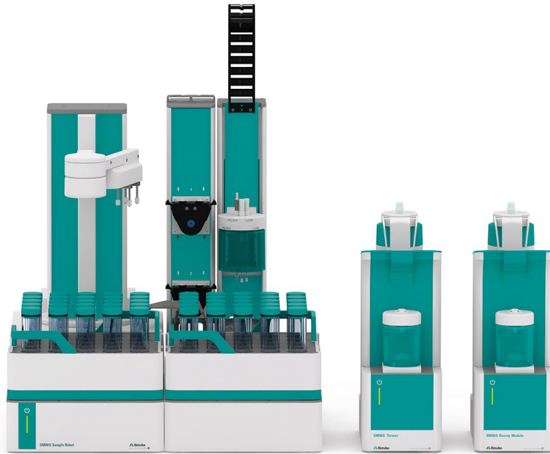
Figure 1. OMNIS Titrator with an OMNIS Dosing Module and OMNIS sample robot.

point. The 5-ring conductivity measuring cell was used for this analysis.