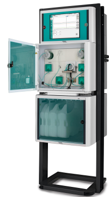
Figure 3. 2060 XRF Process Analyzer.

Incorporating both analysis techniques (i.e., titration/photometry and XRF) in the 2060 XRF Process Analyzer offers users a comprehensive solution for monitoring cyanide levels and metal concentrations in the gold recovery process. This integration enhances plant safety, ensures full recoveries of cyanide from complex solutions, and accelerates return on investment (ROI) by consolidating both methods into one analyzer, thereby reducing footprint and operational costs.