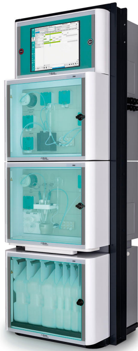
Figure 3. 2060 TI Process Analyzer.