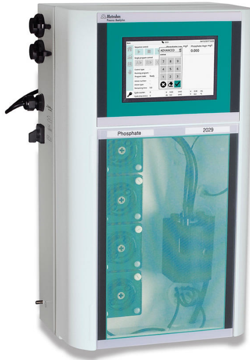
Figure 2. 2029 Process Photometer.