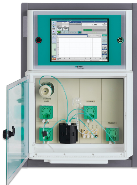
Figure 4. 2035 Photometric Analyzer.