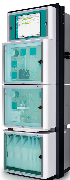
Figure 3. 2060 TI Process Analyzer from Metrohm Process Analytics.