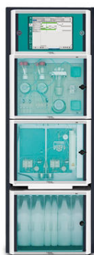
Figure 3. The 2060 IC Process Analyzer is available with either one or two measurement channels, along with integrated liquid handling modules and several automated sample preparation options.