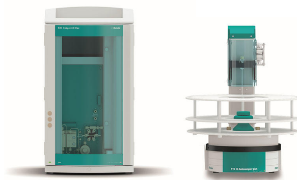
Figure 1. Instrumental setup including a 930 Compact IC Flex Oven/Deg and a 919 IC Autosampler plus.

A one-point calibration with the standard solution of 0.08 mg/mL of USP Calcium Acetate was used for quantification. Samples were evaluated as triplicates. Repeatability studies are done with 6-fold injections.