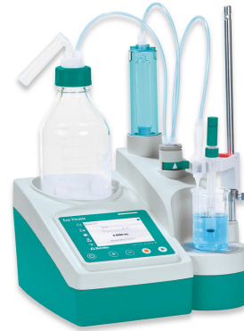
Figure 1. Eco Titrator equipped with a Ca-ISE electrode for the determination of Ca in aqueous solutions.

The sample is titrated with EDTA solution until after the equivalence point.