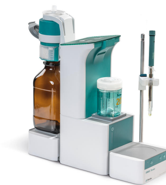
Figure 1. OMNIS Professional Titrator equipped with a dUnitrode with integrated Pt1000.

An appropriate amount of water is pipetted into the titration beaker. After pH measurement, the p- and m-values are determined with fixed endpoints (FP) at pH 8.2 and 4.5 using standardized hydrochloric acid.