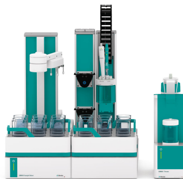
Figure 1. OMNIS System consisting of an OMNIS Sample Robot S and an OMNIS Advanced Titrator.

The sample solution is transferred into a sample beaker and deionized water is added. The solution is titrated with standardized sodium hydroxide until after the second equivalence point. After each titration, the solution is aspirated and the electrode is then rinsed with deionized water.