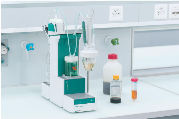
Figure 1. OMNIS Titrator Professional equipped with a dThermoprobe and a rod stirrer.

An appropriate amount of sample is weighed into the titration vessel, and solvent as well as paraformaldehyde are added. Afterwards, the solution is titrated until after the first exothermic endpoint with standardized potassium hydroxide (Figure 2).