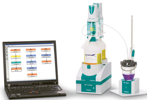
Figure 1. 859 Titrotherm with tiamo . Example setup for the thermometric titration of ferrous iron.

An aliquot of sample is weighed directly into the titration vessel. Both the spike solution (ferric ammonium sulfate, FAS) to improve the detection of the endpoint and diluted sulfuric acid solution are dosed to the sample. The mixture is then made up to a total volume of approximately 30 mL with deionized water. The sample is titrated with standardized ceric ammonium nitrate until after the exothermic endpoint.