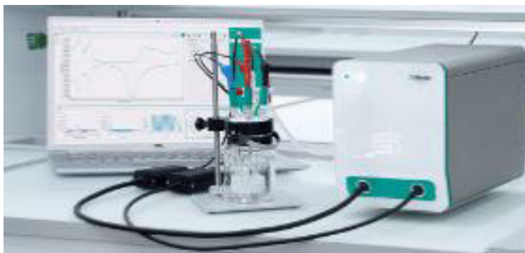
Figure 1. VIONIC powered by INTELLO.

The hydrogen permeation experiment was conducted with two VIONIC powered by INTELLO instruments from Metrohm Autolab (Figure 1).