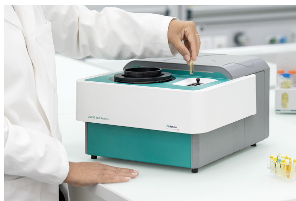
Figure 1. OMNIS NIR Analyzer and a sample filled in a disposable vial.

Samples of 1-methoxy-2-propanol with varying water content (from 0.03% to 2%) were measured with an OMNIS NIR Analyzer Liquid in transmission mode (1000–2250 nm). Reproducible spectrum acquisition was achieved using the built-in temperature control at 30 °C. For convenience, disposable vials with a pathlength of 8 mm were used which made it unnecessary to clean the sample vessels. The OMNIS software was used for all data acquisition and prediction model development.