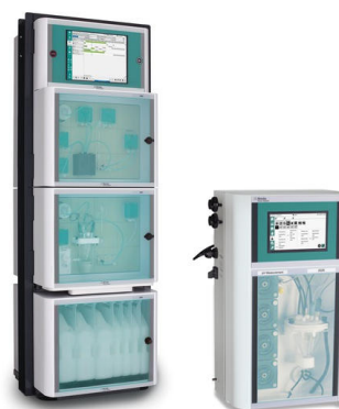
Figure 3. Some of the Metrohm Process Analytics analyzers capable of determining the ammonia concentration online. Left: 2060 Process Analyzer, right: 2026 Titrolyzer.