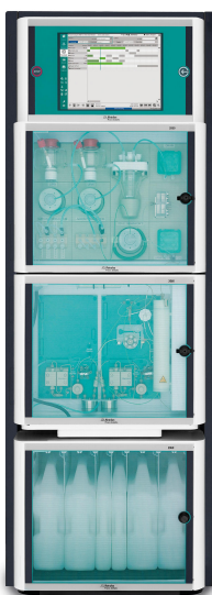
Figure 2. The Metrohm Process Analytics 2060 IC Process Analyzer, along with integrated liquid handling modules and several automated sample preparation options.

The 2060 IC Process Analyzer can run for extended periods in less-frequented areas as there is adequate space reserved for reagents, containers of ultrapure water and/or prepared eluent, and level sensors to alert users when liquid levels are low. By choosing a